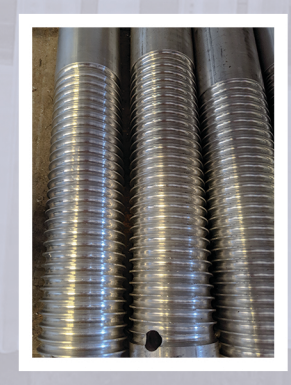
Solid Aluminum Deep Grooved Winder