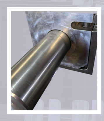
The Drive Shaft is Machine Fit to the Gearbox (No Spacers)